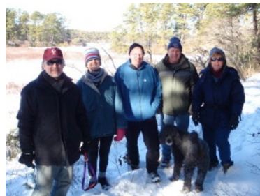
Kids and good dogs welcome!

Join Friends of MSSF on The first Sunday Walk, February 1, 2009. Meet at the Long Pond Road (East Entrance) parking lot, 1:00 p.m. for exercise, conversation, and outdoors enjoyment.